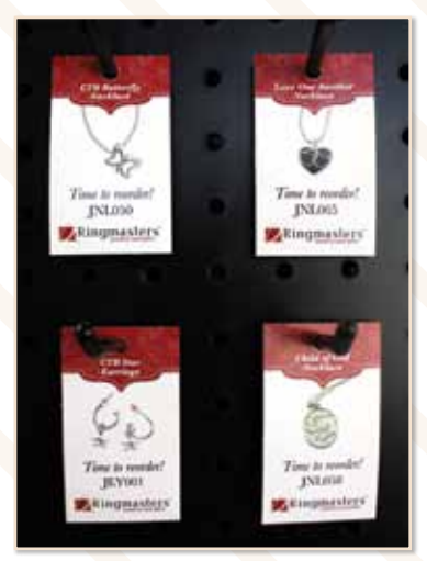
Don't forget to ask about reorder cards! Keep your display organized and your on hand quantities correct. For more details, see page 2.

addition to these benefits, the Carded Ring Program is a proven way to increase your store's sales. Call our Customer Service Representatives for more details.